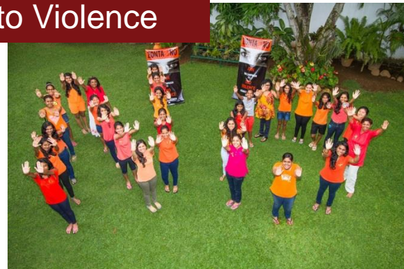
The Z Club of Colombo, Sri Lanka Says NO to Violence Against Women.