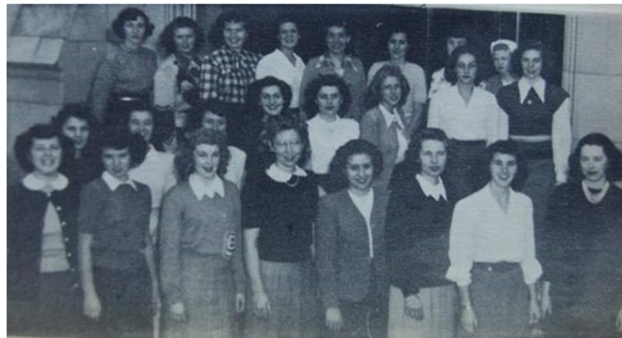
Members of one of the first Z clubs, Z Club at John Burroughs High School in Burbank, CA, USA

Young women(students, trainees) up to app. 30 years