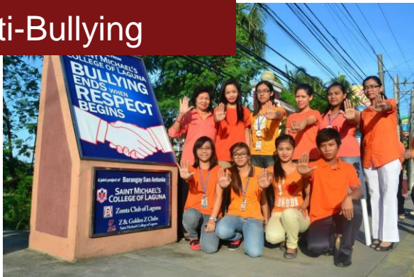
Z and Golden Z Club of St. Michaels College of Laguna advocate for respect and anti-bullying.