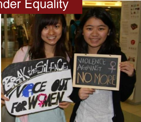
Hong Kong Student Union Golden Z Club launches Gender Equality Awareness Campaign.