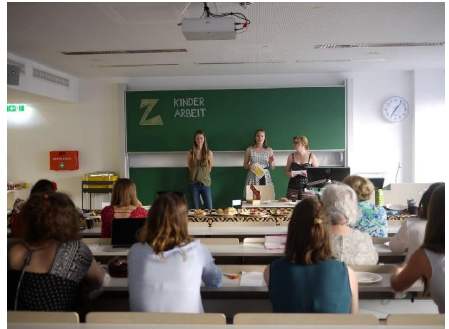
Members of the Golden Z Club Vienna Work shop about child labor